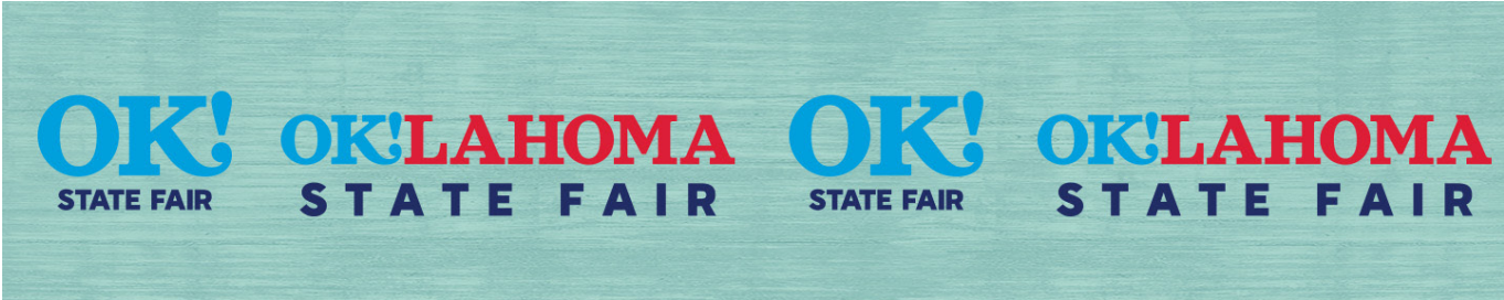
Figure 3: NanoLumens Display Type 2 sample content