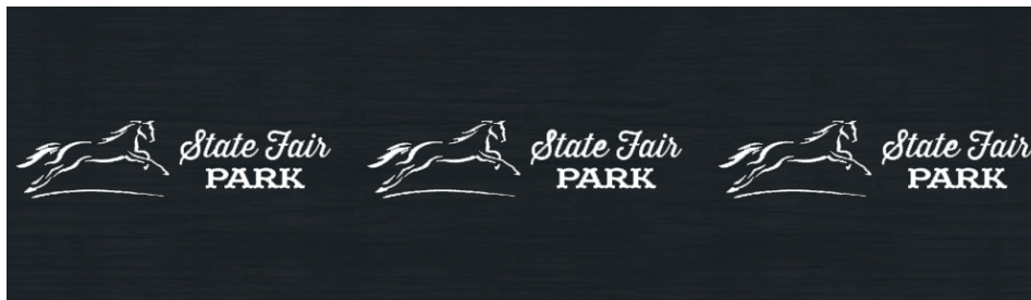
Figure 1: NanoLumens Display Type 1 sample content